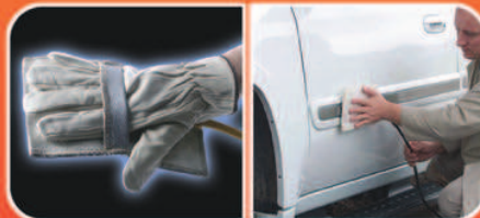
Body Pro Inductor